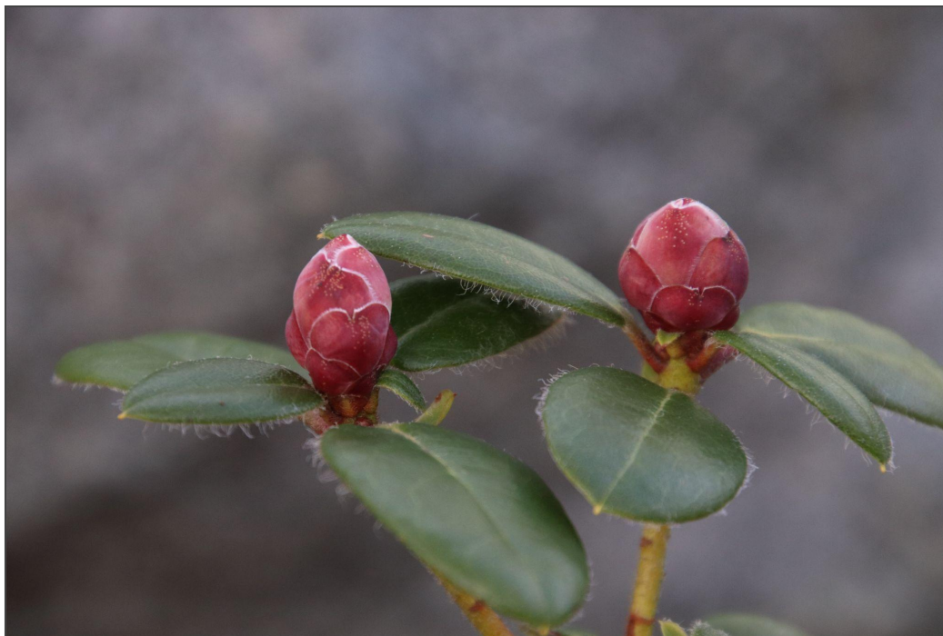
R. 'moupinense' buds