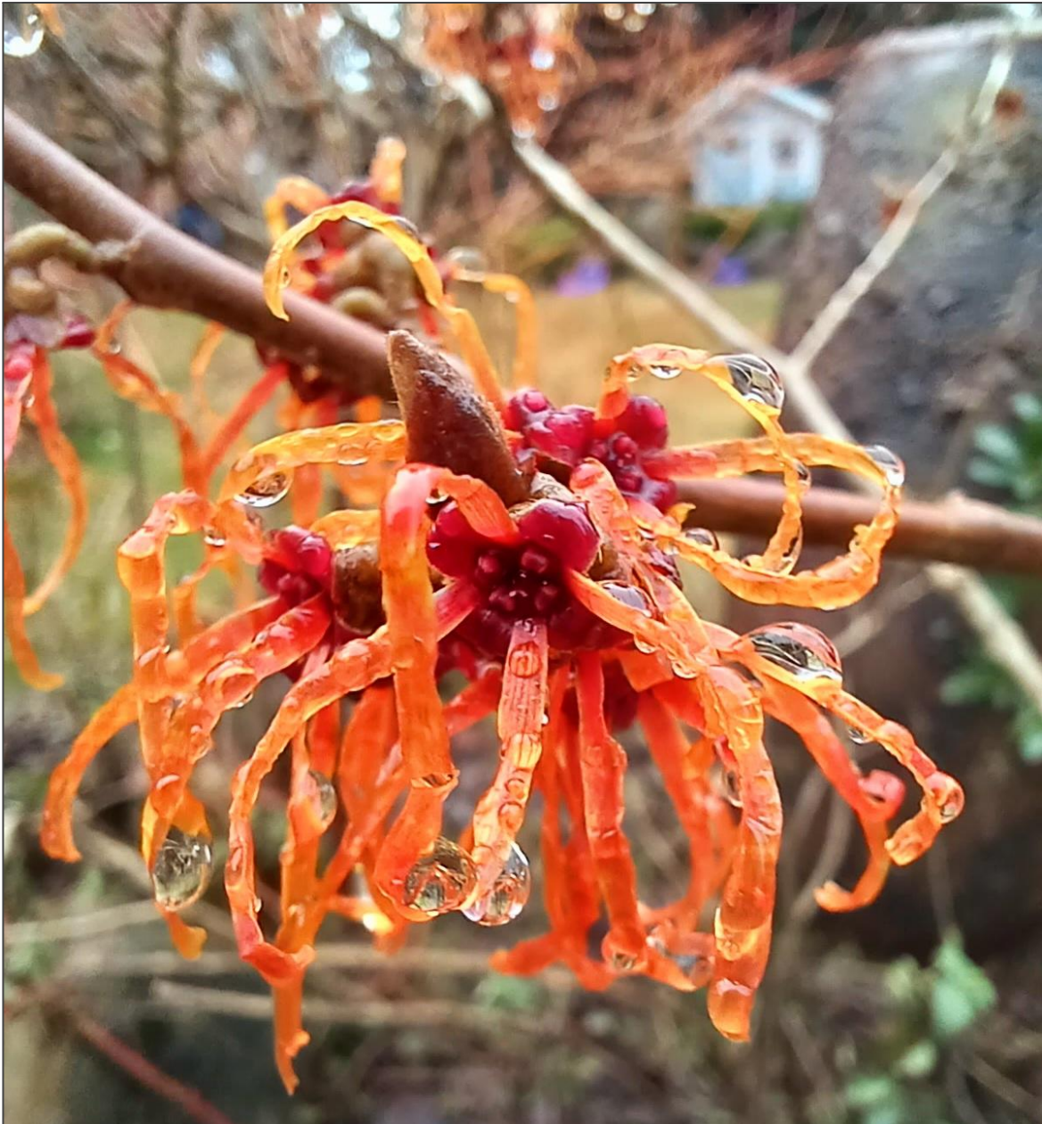
Orange Witchhazel bloom - Hamamelis "Jelena"