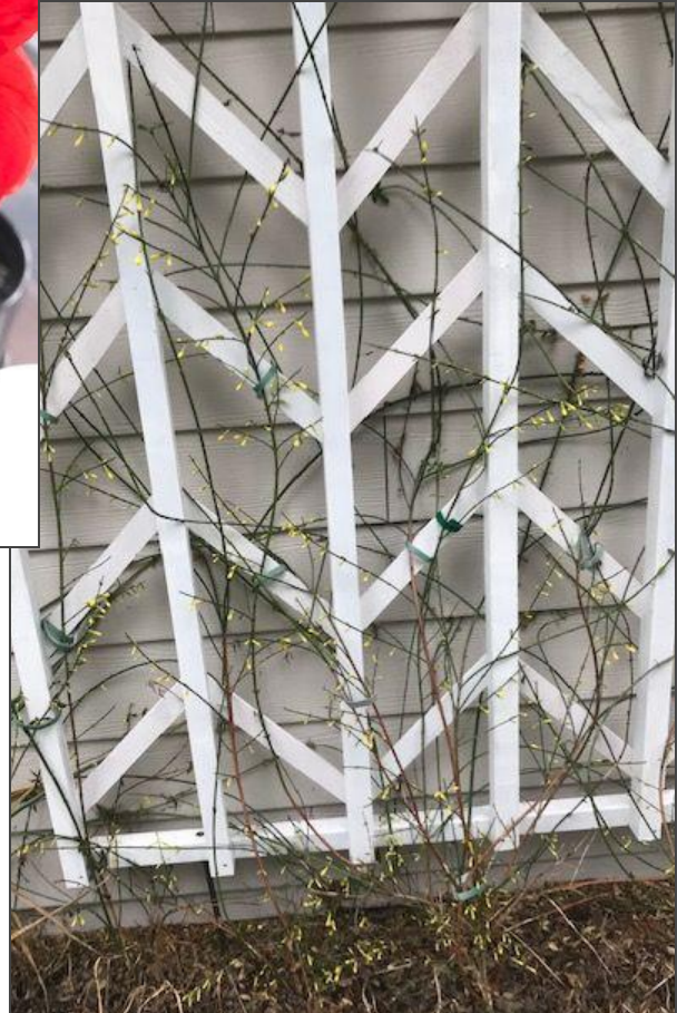
Amaryllis and Winter Jasmine just starting to bloom.