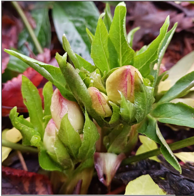
Helleborus buds