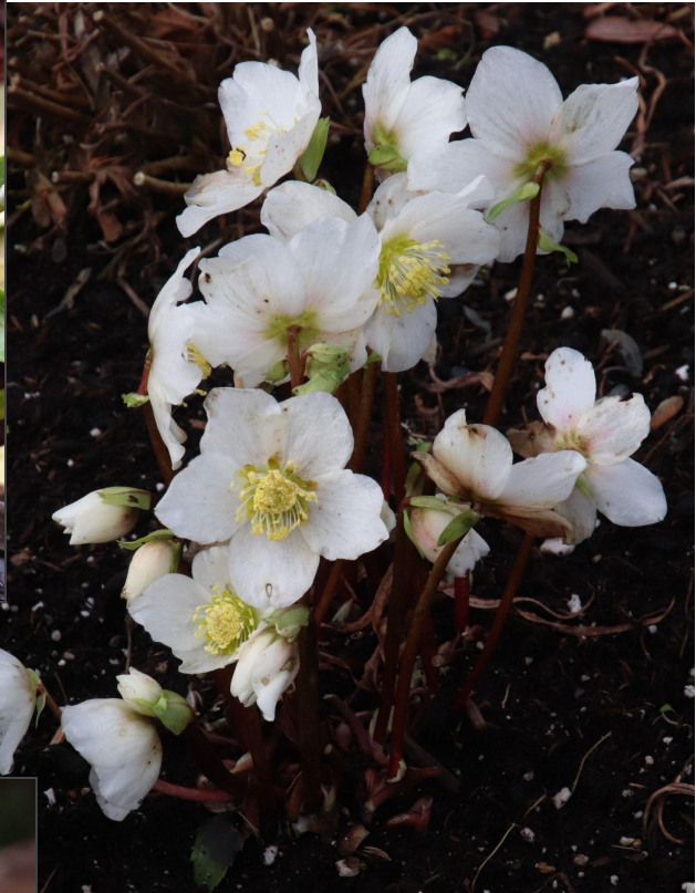
Helleborus niger