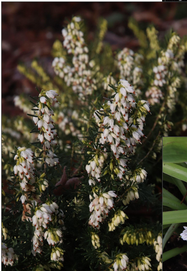
Erica x darleyensis 'White Perfection'