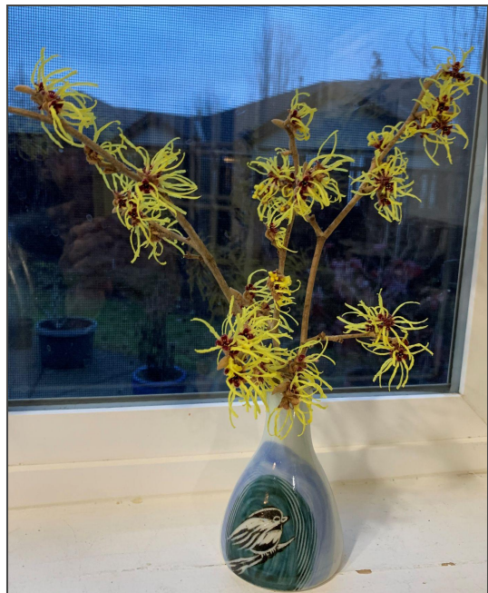
Hamamelis x intermedia 'Pallida'