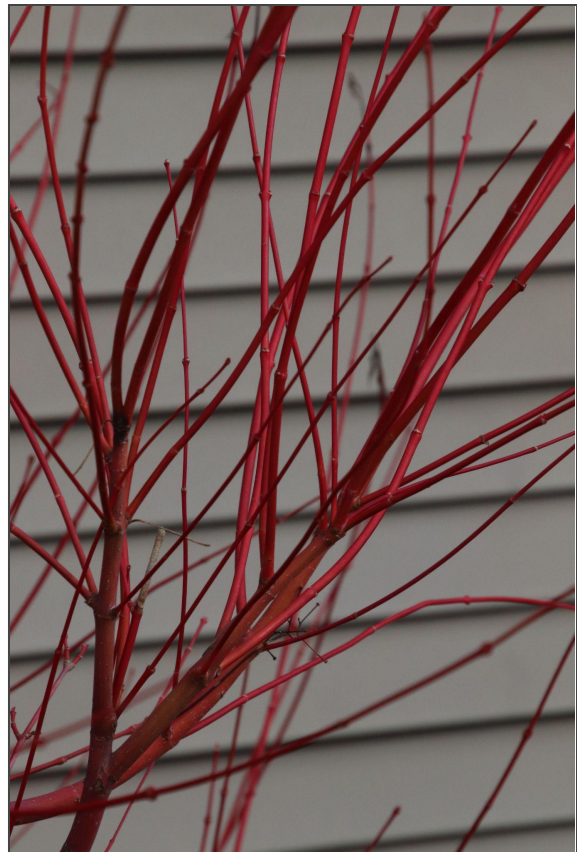
Beauty Berry - Callicarpa bodinieri (top) and Acer 'Sangu Kaku'