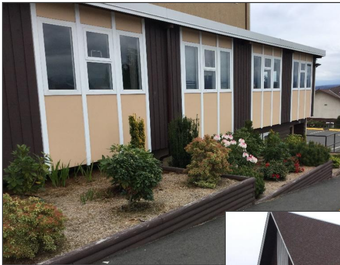
Five years later in 2016