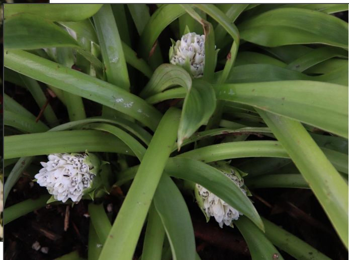
Ypsilandra thibetica