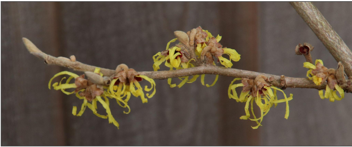
Hamamelis x intermedia 'Pallida'