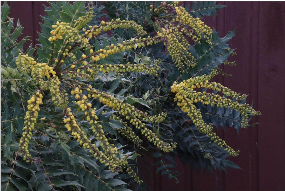
Mahonia x media 'Charity'

This year we are looking for additional vendors for the sale. Our propagation rhodos are coming to an end and we could use a few other vendors of garden-related items (bird houses, bee houses, other plants, etc.) If you or anyone you know might be interested, please give Nadine Boudreau a call to discuss.