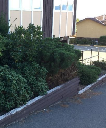
The gardens in the fall of 2019 And blooming in spring 2020