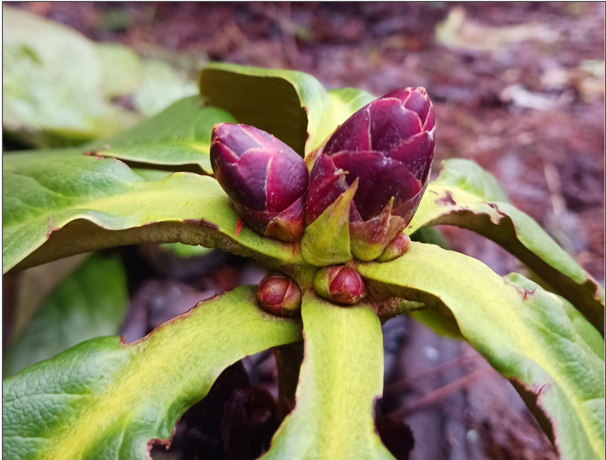
Rhododendron 'rothschildii' buds.